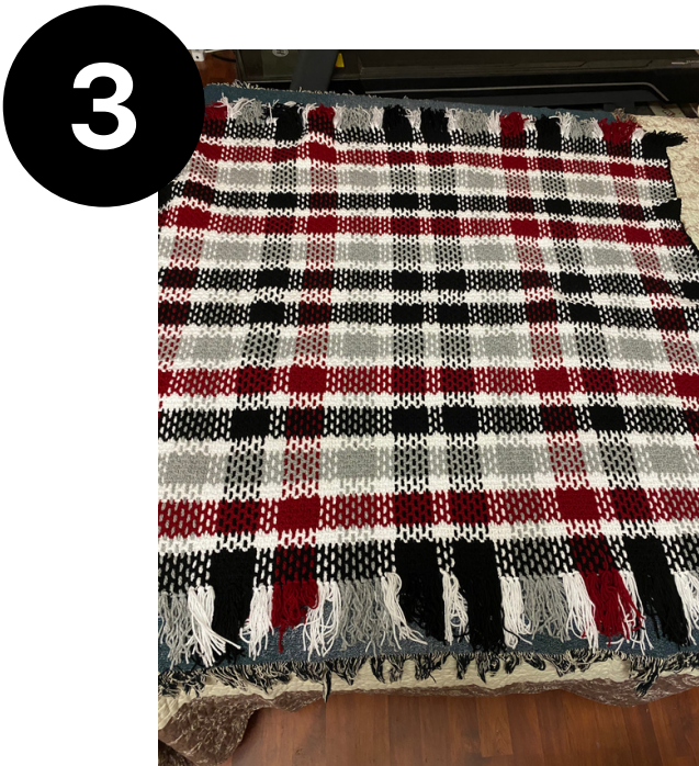
Hand crafted Crochet Stadium Blanket by Cyndi Quinn