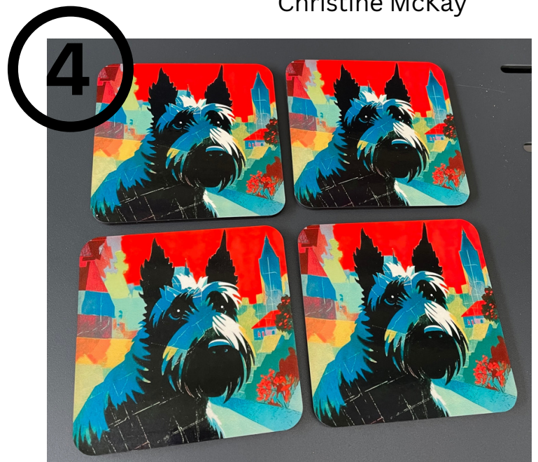
Set of 4 Scottie coasters- Designed by Catherine Butterworth