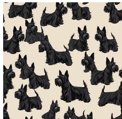
PAST SHOW RESULTS