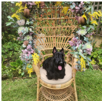
ARCHIBALD SCOTTISH TERRIERS HISTORY