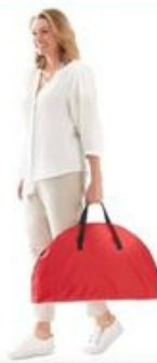
FABULOUS FOLD UP TABLE DONATED BY NARELLE MINERS